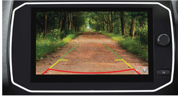
Reverse parking camera with guidelines