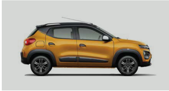
Metal Mustard - Dual Tone