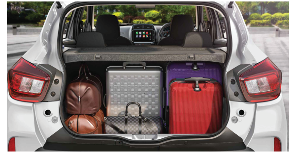
Boot space of 279 litres - expandable up to 620 litres