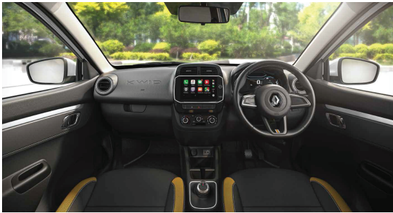
Dual tone interiors with day/night adjustable IRVM