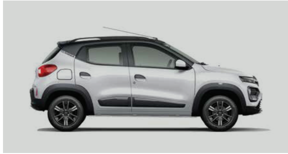
Ice Cool White - Dual Tone