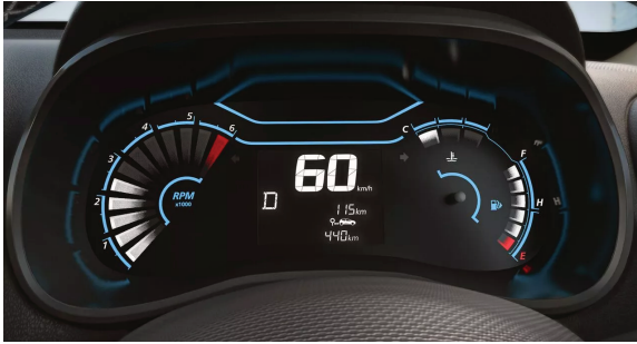
LED digital instrument cluster