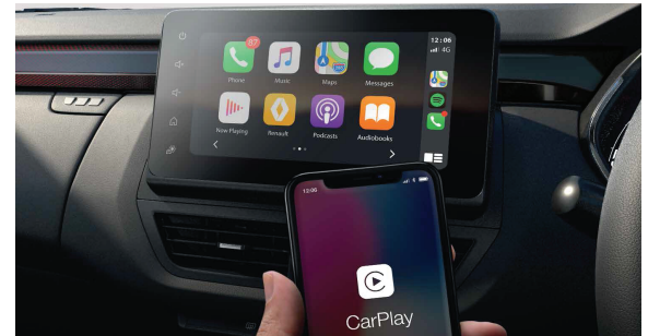
Wireless smartphone replication