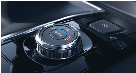
Multi-sense drive mode