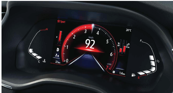
17.78 cm reconfigurable TFT cluster