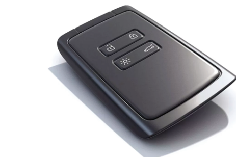
KEESY (Keyless Entry System)