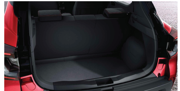
Boot space of 405 litres